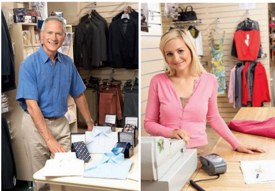
Typical work involving standing in the retail business

Standing in one position for a long time strains the body as major groups of muscles remain tense for a sustained period of time. Maintaining just a single posture leads to muscle fatigue over time and the adoption of a poor posture with associated pressure loading on the intervertebral discs and also tension in the muscles in the neck and torso. In the long-term, activities that involve long periods of standing can lead to back pain, varicose veins, circulatory diseases and fatigue. Studies carried out by the German Federal Agency for Occupational Health and Safety (BAuA) on the subject of "Women with jobs involving standing" have shown that more than 50% of all female sales assistants have experienced health problems, and almost every other one of them frequently uses medications to combat pain and circulatory problems.